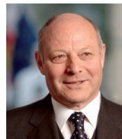
Dr. Luis Durnwalder Governor of South Tyrol

Date: Saturday, 13 th October 2012 10.00 a.m.: Wine tasting at the winery of Nals-Margreid-Entiklar